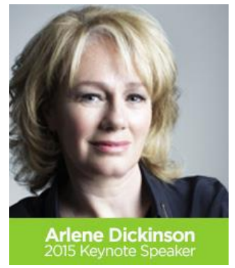
From CBC TV's Dragons' Den & CEO of Venture Communications & YouInc.com

The 200+ delegates at this conference are made up of 80% senior corporate executives and 20% established entrepreneurs representing many of Canada's leading companies and organizations. This high caliber group of delegates hold positions ranging from CEO to Vice Presidents, Directors, Owners and Partners from industries including finance, education, health care, media, marketing, communications, technology, consumer goods and services, government and manufacturing.